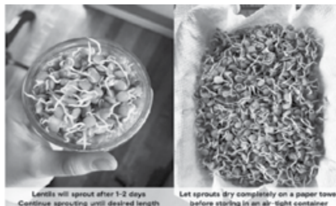
Lentils will sprout after 1-2 days Continue sprouting until desired length