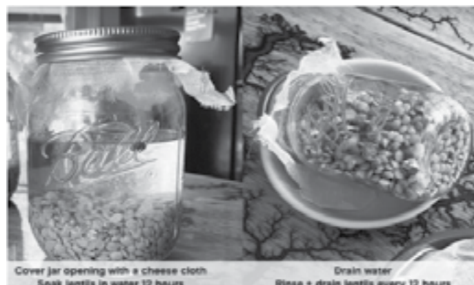
Cover jar opening with a cheese cloth Soak lentils in water 12 hours

Seeds don't need sun to germinate since they're mostly under the ground, just a little warmth. I keep my jar in the north facing kitchen window and the lentils sprout as they should. There is a chance they will overheat and dry out in a sunny windowsill. Come back to your jar a couple times a day, give your lentils a rinse and return the drained lentils to the jar. After as soon as 24 hours you may see some little tails starting to form. After about two days the lentils will have nice tails and will have approximately tripled in volume. Leave them another day and you'll have approximately quadruple the volume of lentils that you started with. Hey presto! Tasty, nutritious additions to salads, sandwiches, stir-fries and wraps.